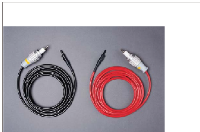
Cable set GA-00090